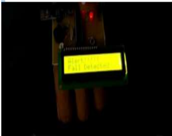
Figure 4 Fall Detected

Events that occur as a result of human action can now be located using technological means. The device, as seen in the image below, is capable of sending out an alert.