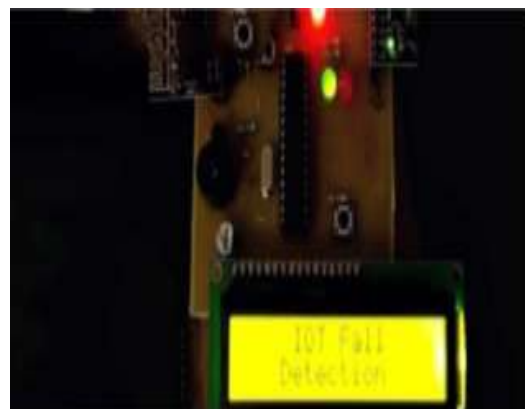
Figure 2 System Switch-on