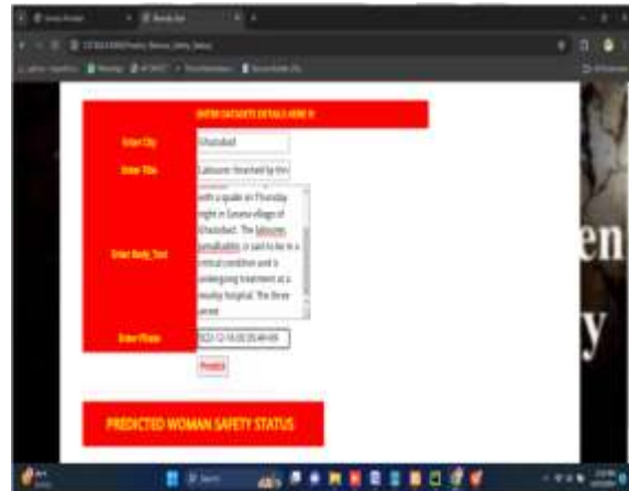
Figure 2 Enter Values for Prediction

This gives a basic idea of how everything fits: This study uses floating-point numbers with identifiable features. A class variable or option class is also present. The Kaggle machine learning database provided this data. This research will employ 30% for assessment and 70% for model instruction. One filter is logistic regression. The categorization report confirmed our forecasts. This analysis's outcomes depend on many study conditions. The algorithms with the best true positives, false positives, true negatives, and accuracy stand out in this study.